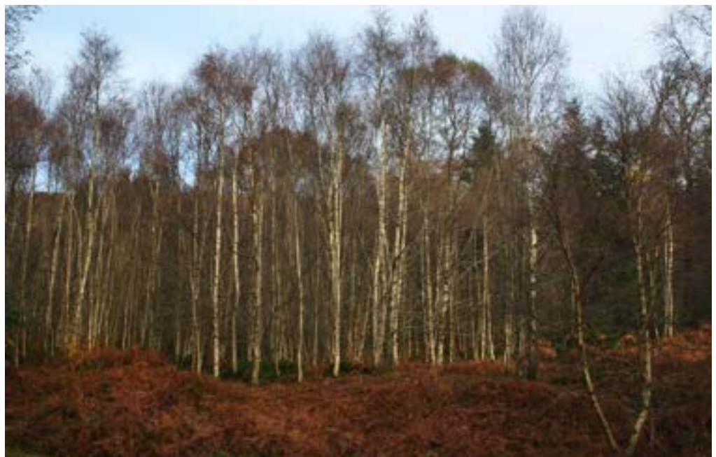
Naturally regenerating birchwood, Vale of Clara Nature Reserve, Co. Wicklow.

On certain sites, several non-native tree species seed prolifically, particularly beech, sycamore and (locally) Lodgepole pine. Where mature trees of these species are present in the canopy or nearby, the creation of open spaces can encourage their regeneration to the detriment of native species. Non-native trees either approaching or of seed-bearing age should therefore be removed from the canopy, to reduce the potential for their regeneration and to create gaps for native trees and shrubs. However, be aware of the value of older non-native trees, particularly those of veteran status. Such specimens may form important habitats for bats or for saprophytic organisms, or may have a significant landscape, cultural or historical value. As such, reasons for retention may outweigh reasons for removal. If individual trees are retained, they should be