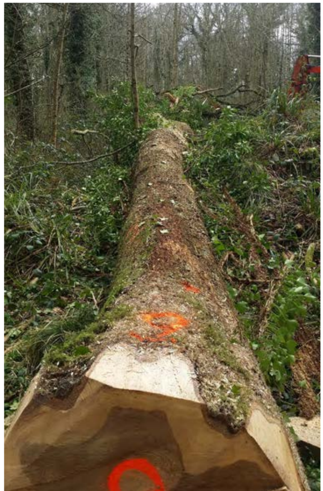
High quality oak felled for coopering within a native woodland sustainably managed under CCF. Ballytobin, Co. Kilkenny.

Similarly, refer to the National Parks & Wildlife Service website www.npws.ie regarding details of any consent required if proposing to undertake certain activities within nature conservation areas such as SACs, SPAs, NHAs and pNHAs.