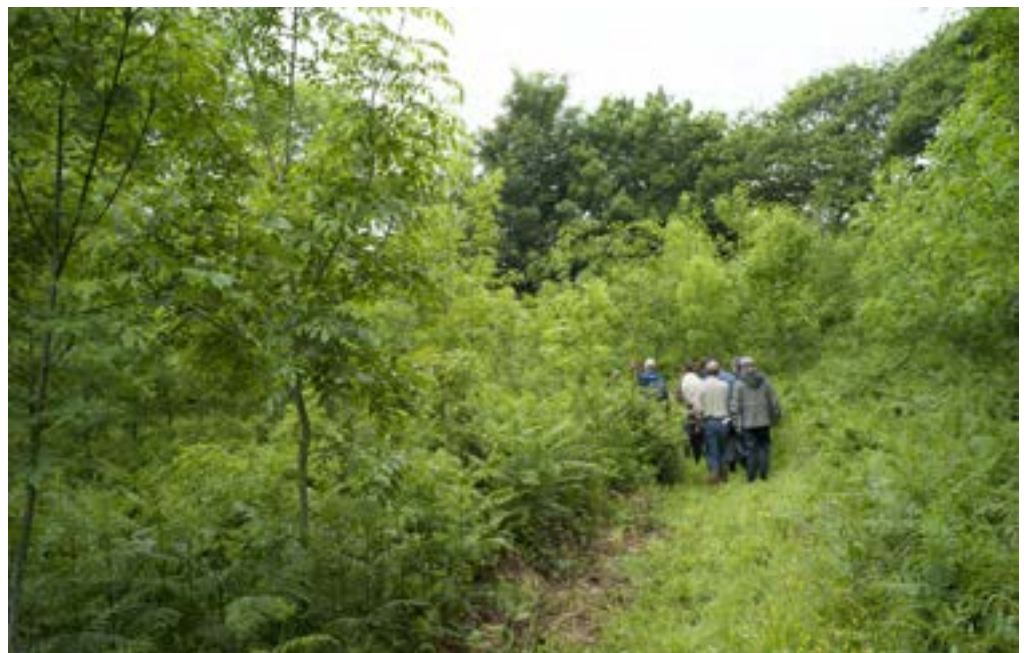
A young stand comprising ash and oak, established under the Native Woodland Establishment Scheme with minimal site disturbance and input. Manch Estate, Dunmanway, Co. Cork.