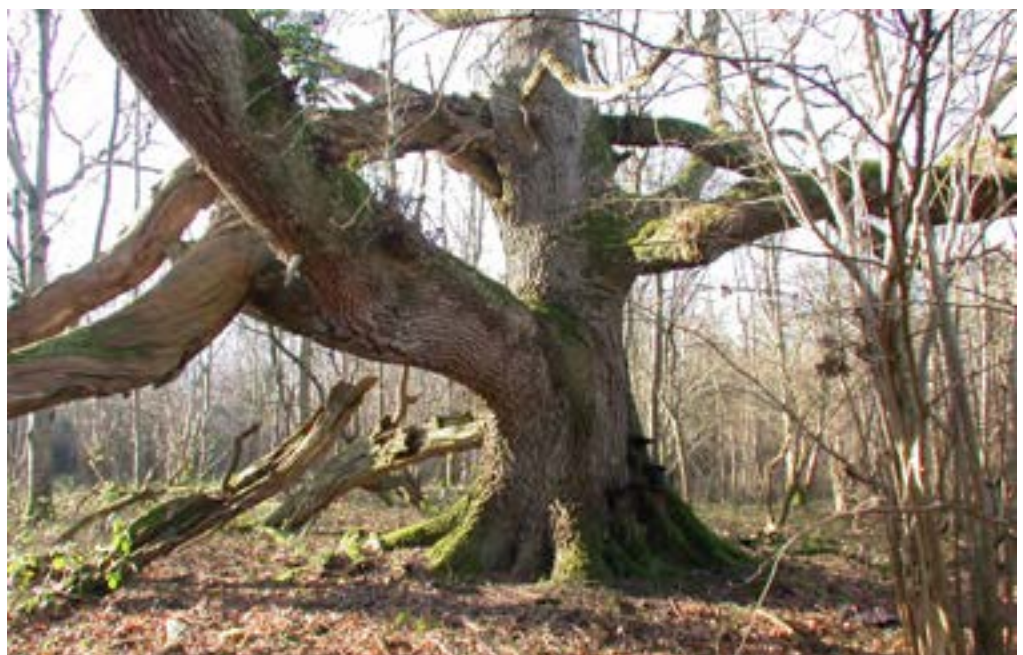
A veteran oak tree, possibly over 400 years old, with dead boughs and bracket fungi. Charleville, Co. Offaly.

The recommended amounts of deadwood within a native woodland vary considerably and are sometimes conflicting. It is generally accepted, however, that large diameter deadwood provides a far wider range of habitats than smaller diameter deadwood. As