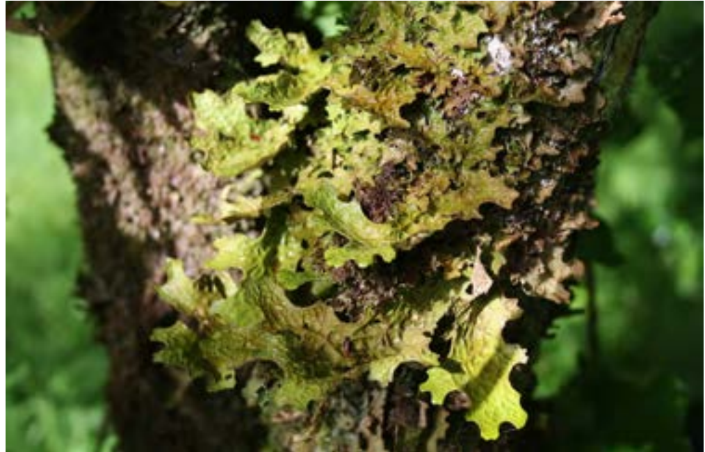
Tree lungwort on a large, fissured hazel stem, Ballyarr Wood Nature Reserve, Co. Donegal.

deadwood in hazel woodland tends to be smaller in diameter compared to other woodland types. Retain moribund trees and if necessary, create additional deadwood.