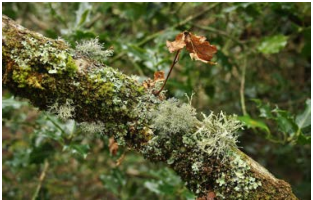
Epiphytes, Tomies Wood, Co. Kerry.