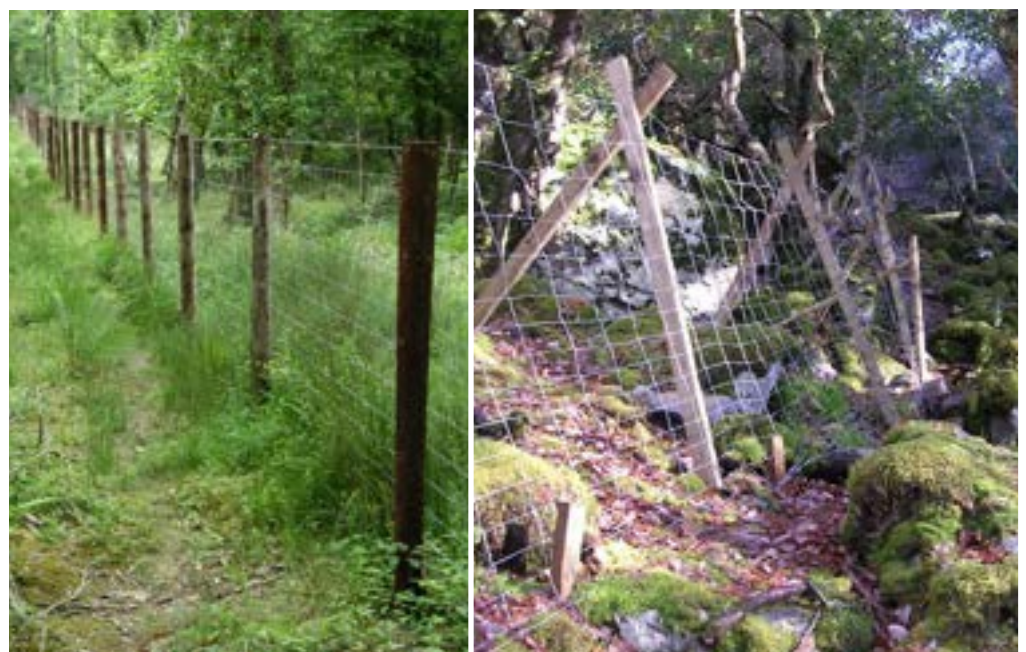
(Left) Conventional deer fencing, Charleville, Co. Offaly.

There are arguments both for and against the various methods described above, and decisions should be taken on a case-by-case basis. A combination of two or more