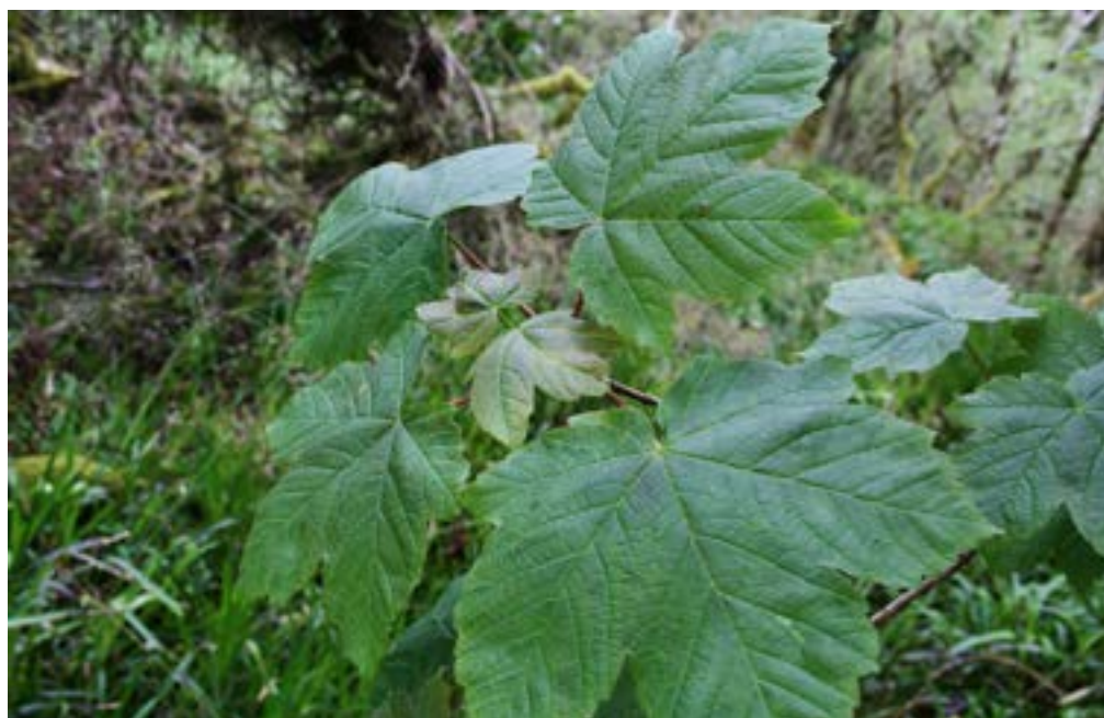
Sycamore, a non-native species which can be invasive on more fertile soils.

Rhododendron ponticum is the most aggressive of all non-native plants found in our native woodlands, and its control presents immense difficulties. It is very widely distributed, principally (but not exclusively) on acidic soils. Details of its ecology and life history are well-documented (Cross, 1975, 1982 & 2002). Methodologies for its control are set out by Higgins (2008) and by Barron (2007),