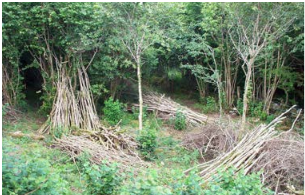
Hazel coppice stool and harvested hazel rods. Ballyvary, Co. Mayo.

Pollarding is similar to coppicing except that the trees are cut higher so that the new growth is out of the reach of grazing animals. The result is a tree with a short trunk