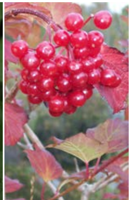
Guelder rose with flowers and berries, a typical shrub of alder woodlands.