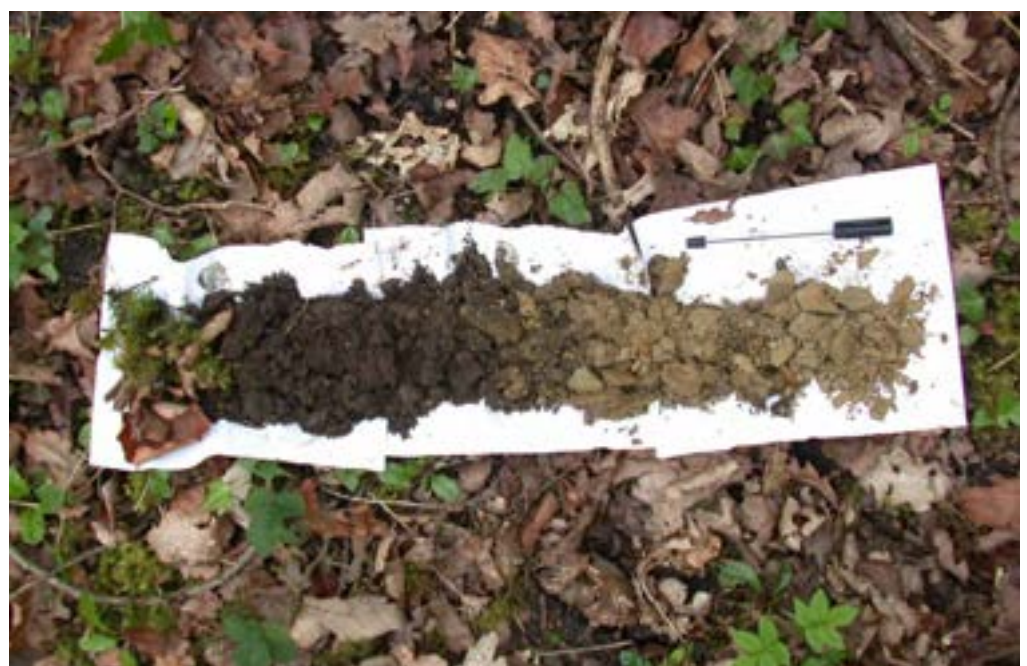
A soil core taken within woodland at Charleville, Co. Offaly, indicating a free-draining brown earth. Soil identification is a key part of native woodland planning and management, as it assists in identifying the most appropriate native woodland type and species to promote onsite.

It is now well-recognised that the conservation of woodland species and ecosystems cannot be achieved within the boundaries of individual sites. Therefore, a strategic landscape-level approach is needed to achieve a critical mass of woodland cover, to target high value woodlands and to reduce fragmentation, particularly through the restoration of riparian woodland corridors and by reinforcing existing clusters of native