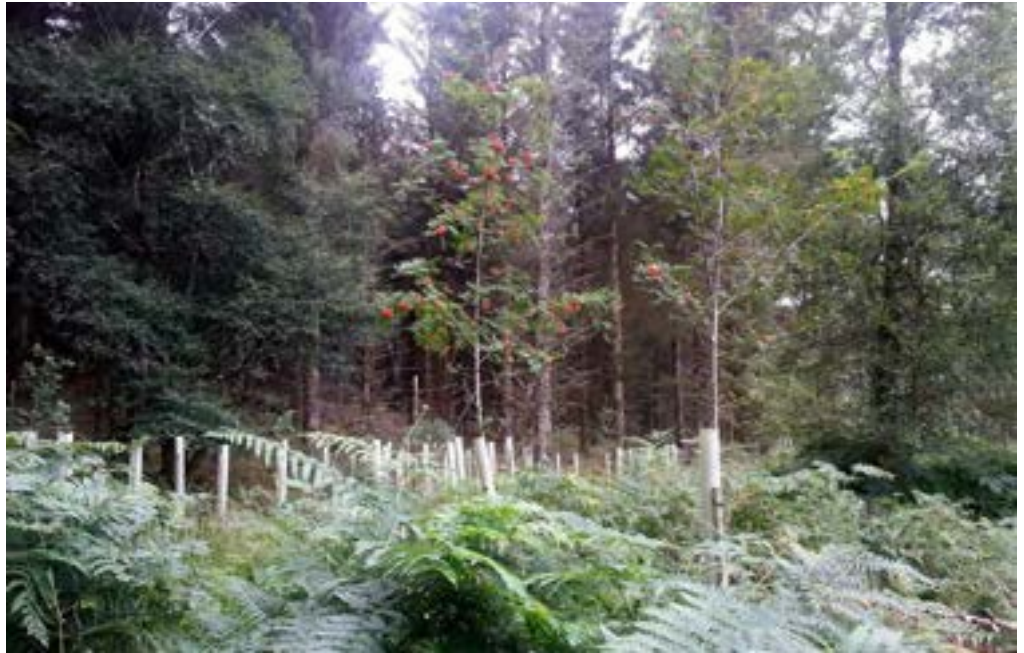
Phased transformation of a stable Sitka spruce plantation, through group selection. Brockagh, Glenmacnass, Co. Wicklow.

ongoing management and the periodic extraction of material from trees harvested individually or in small groups. The machinery used is often small in scale, although larger machinery can be more appropriate in various situations – see below.