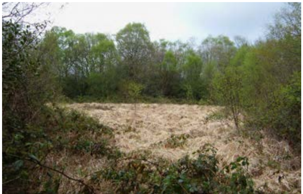
A small Molinia fen in spring within a mixed oak-ash-alder wood provides open, sheltered habitat. Co. Galway.

The more diverse the woodland structure is, the greater the biodiversity and hence, the woodland's conservation value. Rare and critical species may depend on structural diversity, particularly the presence of old trees that may have rot holes and dead and decaying branches. Some species require very specific habitats. For example, some invertebrates require large trees with rot holes, while a continuity of micro-habitats over time is important in order for certain lichens to survive. The sheltered interior of woodlands is particularly important for some species. Here, the edge influence peters out, conditions are normally darker and damper, and micro-climatic variations are less. Such areas are valuable for certain invertebrates, fungi and birds. Inappropriate