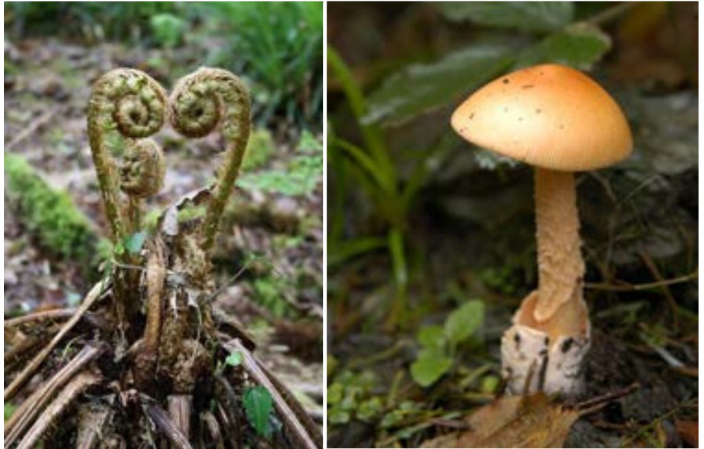
(Right) Orange grisette ( Amanita crocea ), Devil's Glen Forest, Co. Wicklow.

Annex I of the Habitats Directive lists natural habitat types of Community interest whose conservation requires the designation of SACs. Annex I includes five woodland habitat types that occur in Ireland, as follows (the symbol ‘*’ indicates a priority habitat type):