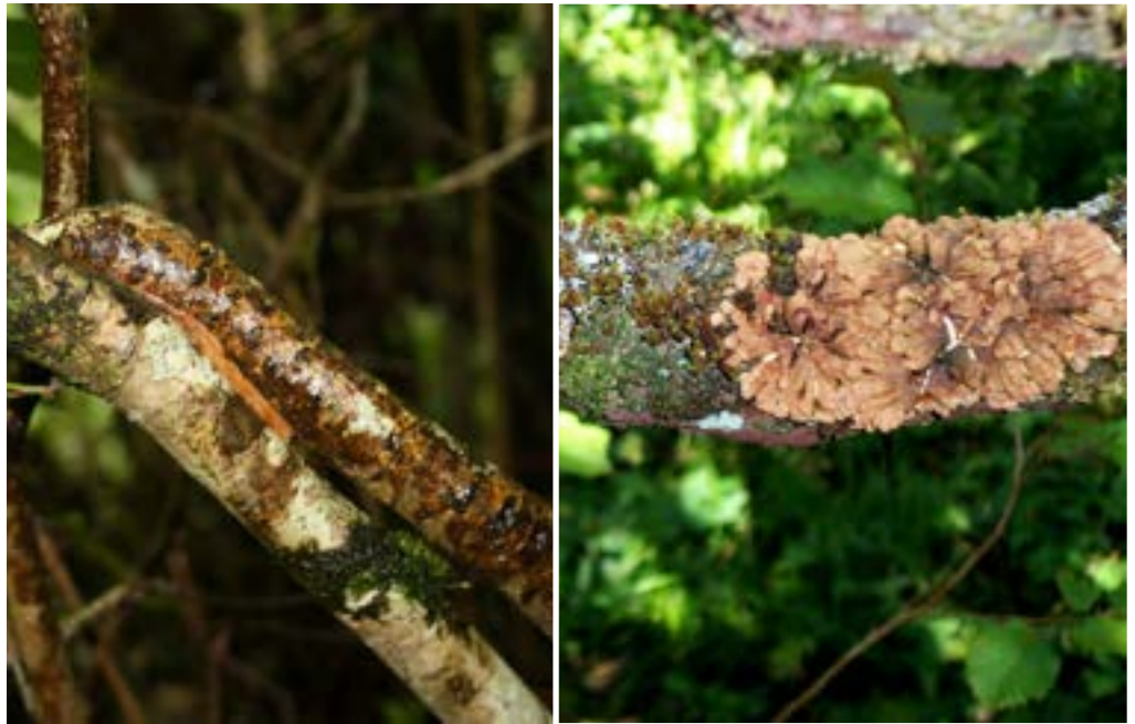
(Right) Hazel gloves fungus, Keelhilla Nature Reserve, Burren.