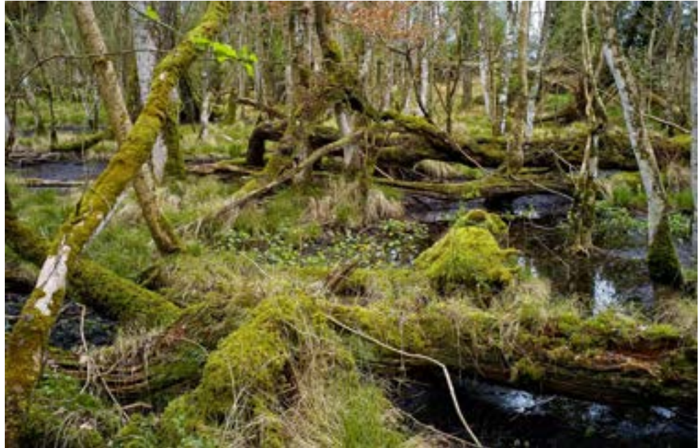
A wet hollow with standing and fallen deadwood, Charleville, Co. Offaly.

long term retention of structural open spaces, particularly where the size of the overall woodland limits the scope to allow natural processes 'free reign'. Cutting woody growth within open spaces (typically with a brush-cutter) is very expensive in terms of time and resources, and also fails to emulate grazing, but may be the only practical method on many sites. However, if possible, consider periodic grazing, but only on a strictly controlled basis and for limited periods of time . Within grant aided projects (including those supported under the Native Woodland Scheme), this approach must be agreed in advance with the Forest Service.