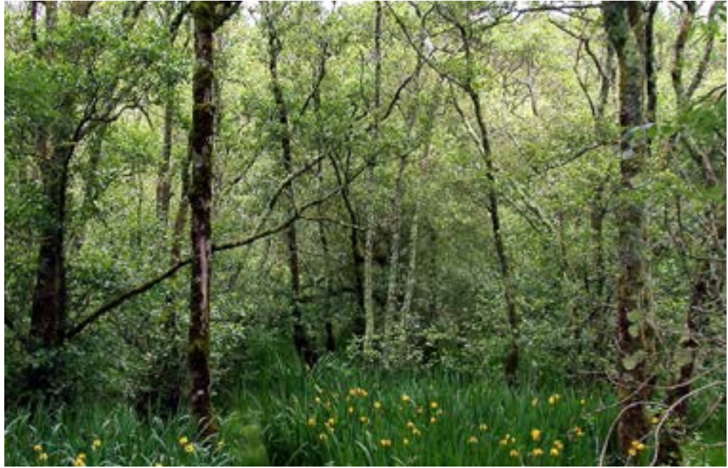
Wetland wood with alder, Reen Wood, Killarney National Park, Co. Kerry.