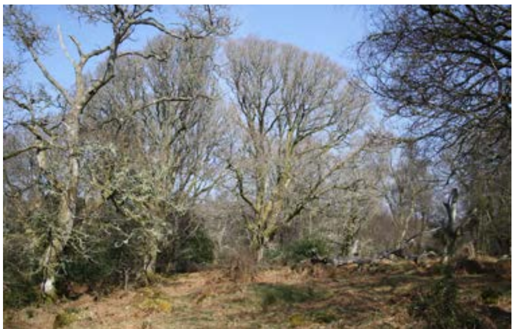
An over-mature, open woodland with stag-headed trees and deadwood, and with little or no regeneration evident.

Woody growth often occurs within open spaces, through natural regeneration arising from the adjoining canopy. While representing a natural process, this threatens the